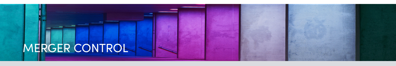
European Union level

Nevertheless, it remains to be seen whether this divestment will be effective over the longer term. While Korean Air and Asiana are well-known carriers in Europe and globally, T'Way is a much more regional player in East Asia. Despite the divestment of assets and slots, T'Way will need to be able to attract enough customer interest to maintain these routes profitably. While the addition of divestment remedies will raise the bar for airlines seeking merger clearance, if effective these new types of commitments may also help alleviate Commission skepticism when considering whether to conditionally clear future problematic airline mergers.